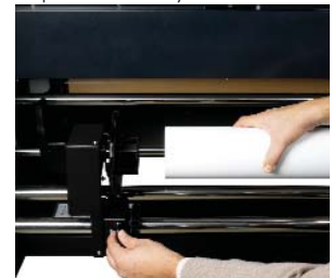
Easy media loading