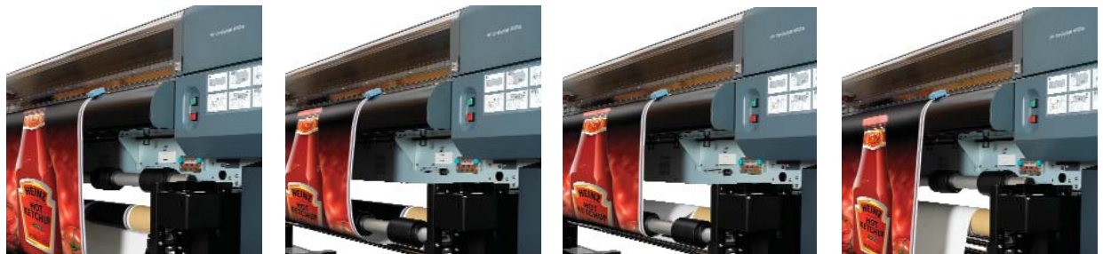
Detail on Take-Up Reel with four winding modes