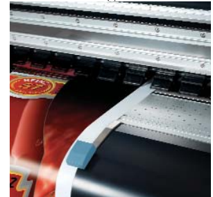
Adjustable vacuum system