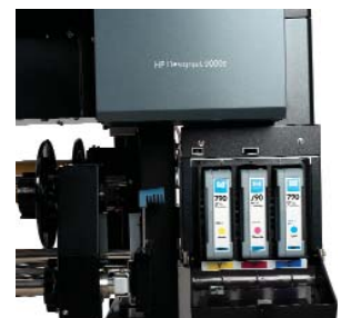
1000 ml HP Ink Supplies