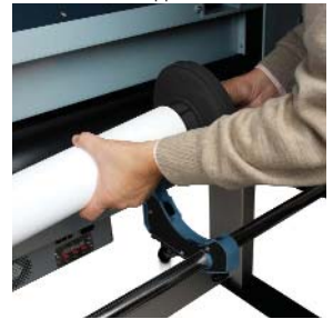
Easy media loading