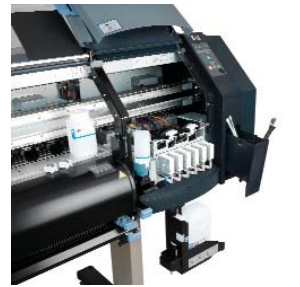
Cleaning station and self-contained tools