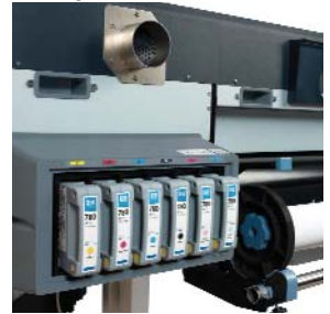
500 ml HP Ink Supplies