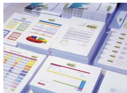
Large volume mail outs